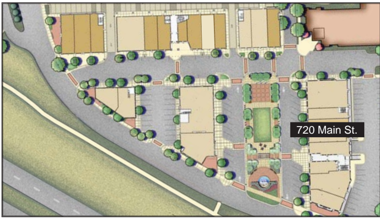
Key Plan: 720 Main Street