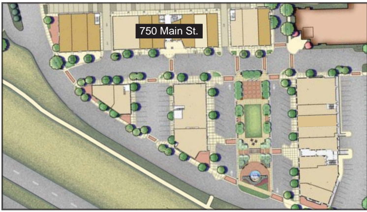
Key Plan: 750 Main Street